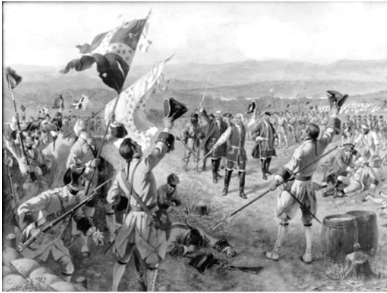
Montcalm Congratulating the Troops, July 8, 1758

Find this painting in the Fort Ticonderoga Museum, then answer the questions by looking at the painting. Please do not touch the paintings in the Museum.